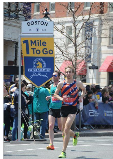
Grimacing with a mile to go