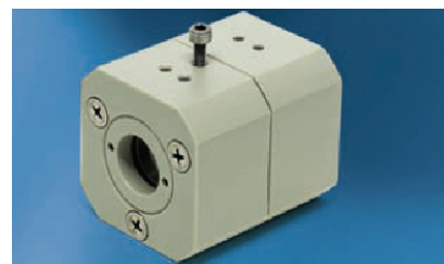
(Figure - 1) Cornea Holders (Pictures of the Instrument and holders adopted from the supplier manual)

A known amount of test item is applied to the anterior surface of the cornea and then the corneas are incubated for required time (depending upon the physical form of the test item). At the end of the incubation period Opacity is measured using the Opacitometer (Manufactured by Duratec, Germany) (Figure 2).