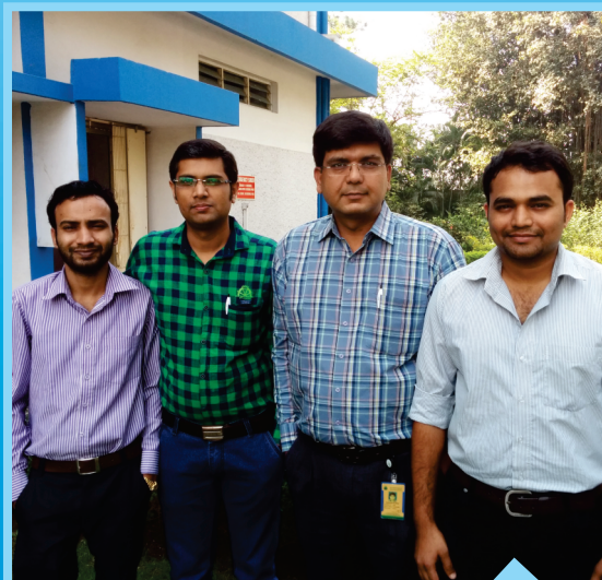
Meet our Team...

Our team of scientists at JRF have successfully developed and established this test at JRF. The standard operating procedures have been established and a GLP validation has been successfully undertaken. The results described in the table below, go on to establish the successful validation at JRF.